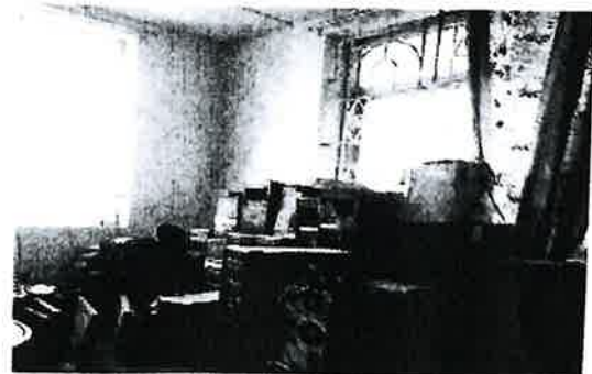
Multiple E-waste collection during drives

u. w. PRINCIPAL MEENAKSHI COLLEGE OF ENGINEERING No: 12, VEMBULIAMMAN KOIL STREET, WEST K.K.NAGAR, CHENNAI - 600 078. App. S. COORDINATOR