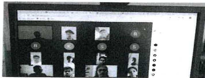
Seminar on "Emerging Issues in IPR: Addressing Challenges in the Digital Age on 26.02.21