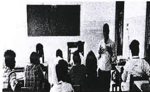
Guest Lecture on "Advancement in Composite Materials for Mechanical Engineering"

The Guest Lecture on "Advancements in Composite Materials for Mechanical Engineering" was a lively event where students learned about the newest innovations in the field. It was well-organized and aimed to teach participants the important things they need to know about composite materials, which are always changing. In the seminar, students took part in workshops, listened to experts, and had discussions. They learned about the different aspects of making composite materials, like Manufacturing Processes, Properties and Performance, and Applications with Advancements. The seminar also talked about the problems people face when using composite materials in mechanical engineering and gave practical solutions. Real-life examples were shared to show how composite materials are making a big difference in different industries. 45 students benefited in the program